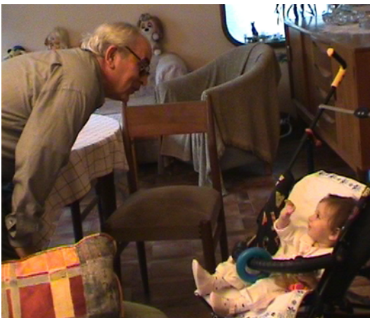
Figure 1.2. The infant grandchild is raising her right hand while she is looking intently at her grandfather who is still leaning towards her and is focused on her with a facial expression of pleasure.