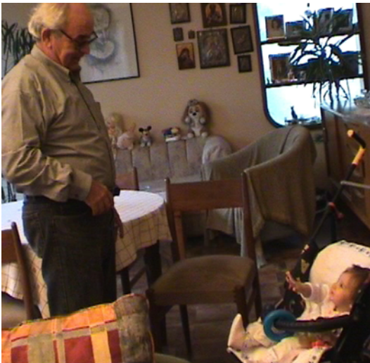
Figure 1.6. At the end of the imitative episode, in the course of mutual eye contact, the grandfather is expressing a relaxed "pleasure" emotional state.

neutral expression, relaxed brows and closed mouth (Murray & Trevarthen, 1985). With the neutralization of emotion the "...facial muscles may be relaxed, or they may be held tensely but without any obvious sign of contraction..." (Ekman & Friesen, 1975, as cited in Saarni, 1982, p. 137). Neutralization of emotion has been defined as a voluntary attempt to maintain little or no display of emotion (Ekman & Friesen, 1969, as cited in Masters & Carlson, 1984).