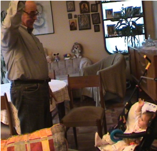
Figure 1.5. The grandfather is imitating his infant grandchild's hand movement (see Note 1) while he is smiling and has now changed his body posture from leaning to his infant grandchild to standing upright. The infant grandchild is still keeping her right hand up and she is looking intensely at her grandfather.