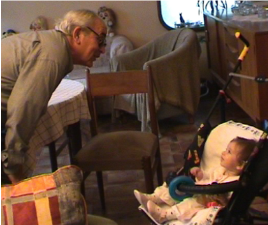
Figure 1.1. Hand movement imitative episode in grandfather-infant grandchild (girl-7.5 months old) interaction: In the course of eye contact, the grandfather is looking at his infant grandchild with a pleasure-interest expression (smile with raised eye brows) while he is leaning towards her and the infant is grinning to him.

or a combination of the following interest expressions: (2a) Momentary intense limb movements or sequences of intense limb movements followed or preceded by motionless and stretched hand and leg postures (infant) or change of body posture which indicates alertness [e.g. grandfather is sitting on a chair, or is leaning to the infant, and then he is standing upright, see Figure 1.1 to 1.6 ]; (2b) The infant is looking intently at the partner with wide open eyes and raised eyebrows; (2c) Coing and/or pre-speech mouth movements ( Markodimitraki, 2003 ; Pratikaki, 2009 ).