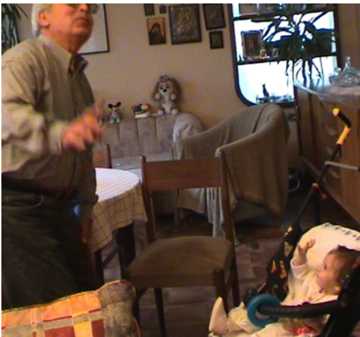
Figure 1.4. The grandfather is orienting his torso, head and right hand, and is changing his body posture to an upright position, in order to imitate his infant grandchild's hand movement while he is still smiling. The infant is keeping her right hand up while she is focused on him.

stronger and more regular (Wolff, 1959, 1963, 1969, as cited in Trevarthen, 1985); d) From about 6 weeks infants show positive affective expression linked to maintained eye contact (Trevarthen 1977, as cited in Trevarthen, 1985); d) “A bright and sparkling eye is as characteristic of a pleased or amused state of mind, as is the retraction of the corners of the mouth...” (Darwin, 1872/1965, p. 204).