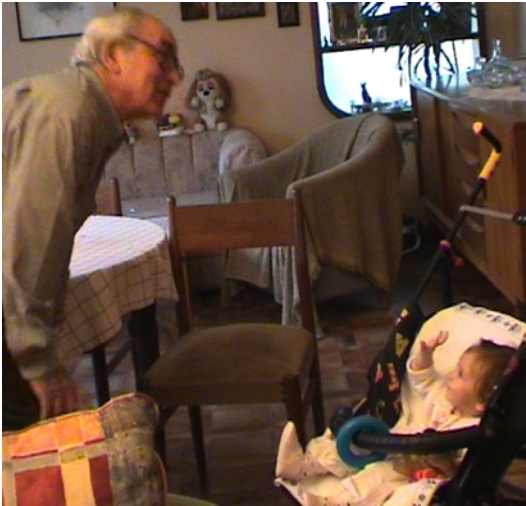
Figure 1.3. The infant grandchild is raising her right hand higher and stretching her fingers while smiling and looking at her grandfather. The grandfather is making a preparatory head movement in order to imitate her with a pleasure-interest expression.